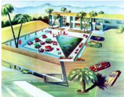
Artist rendering of the Hotel Desert Sun

uses); the 1955 Hotel Desert Sun (just completing a 3 year renovation; don't miss this sneak peek!); and the 1961 Caravan Inn West Motel/Bali-Hi